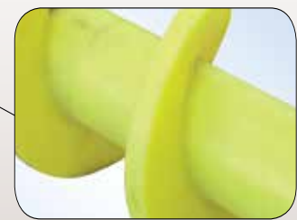
Floating Screw System