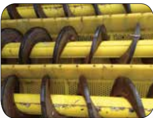
Jagged multi-screw with SINT® screen