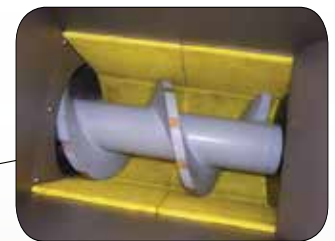
Jagged Conveyor Screw