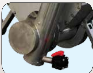
Extracting screw with variable inclination